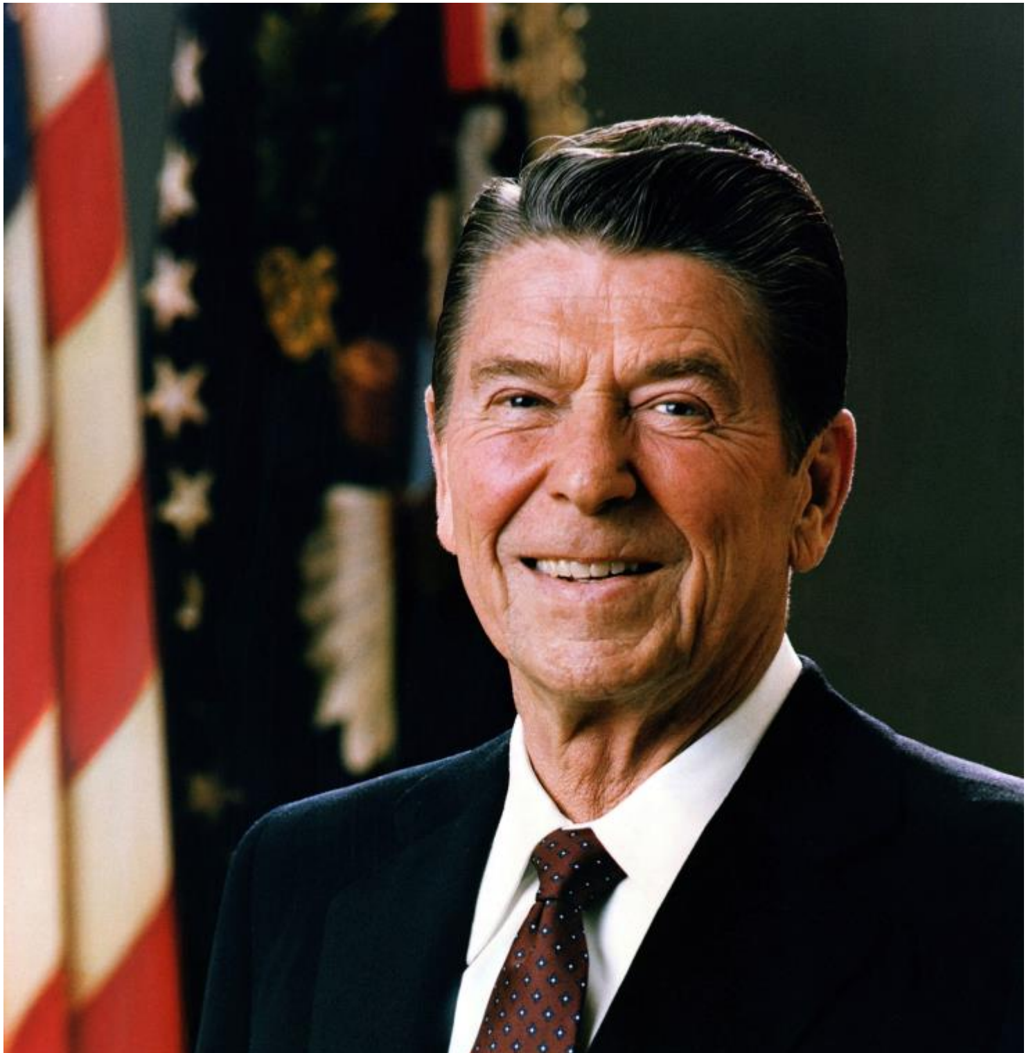
Ronald Reagan at the Dixon Public Library